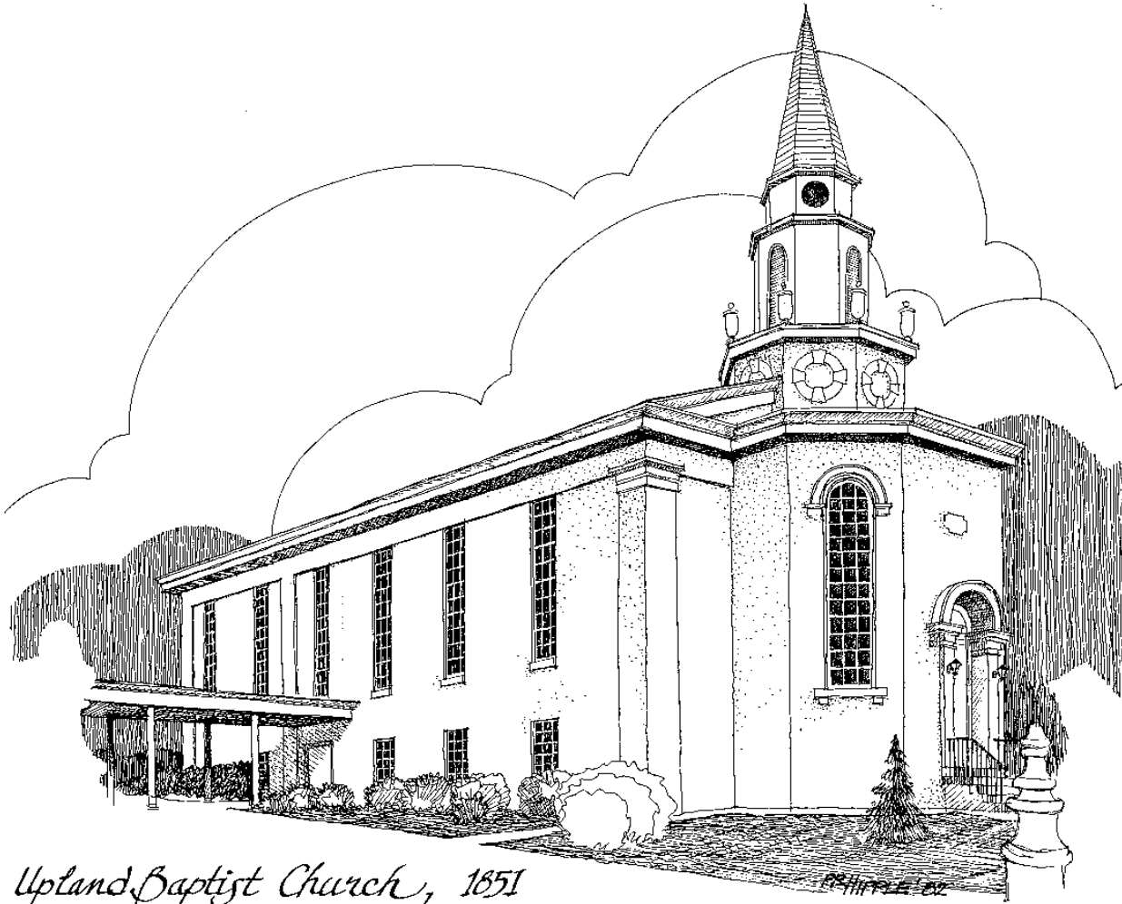
Upland Baptist Church, 1851